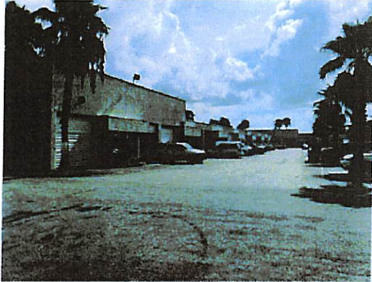
South elevation, east building