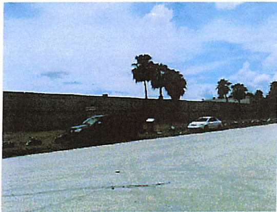
North elevation, east building