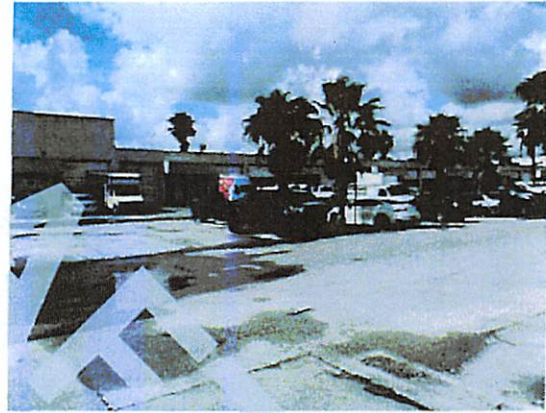
North elevation, west building