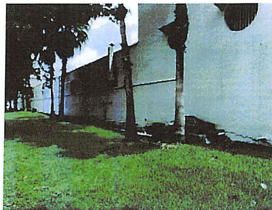
West elevation, west building