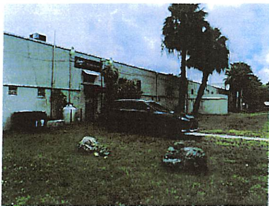
North elevation, west building