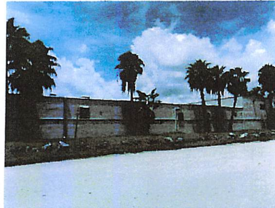
South elevation, east building