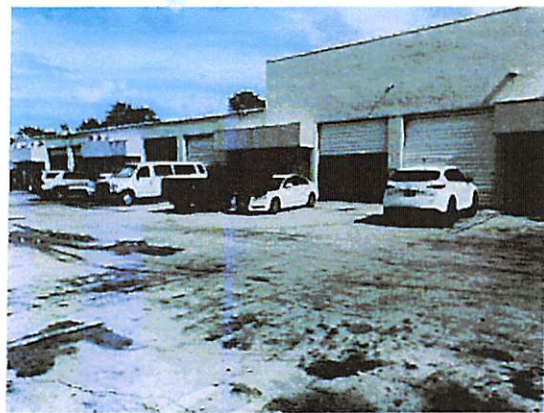
South elevation, west building