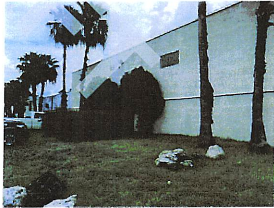
East elevation, east building