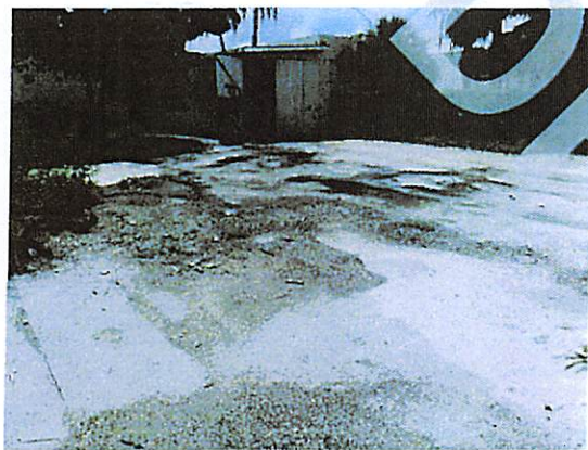
Storage area between east and west buildings