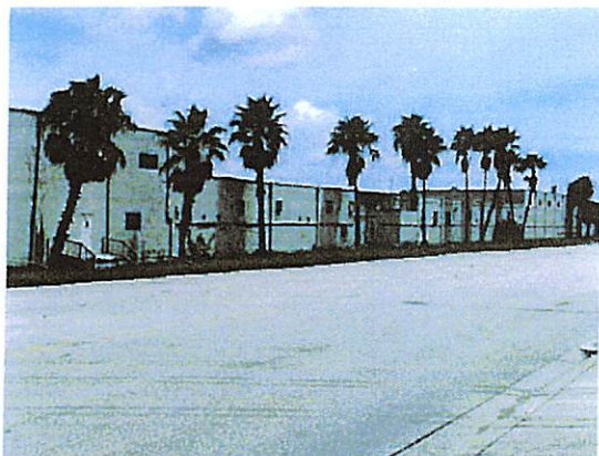
South elevation, west building