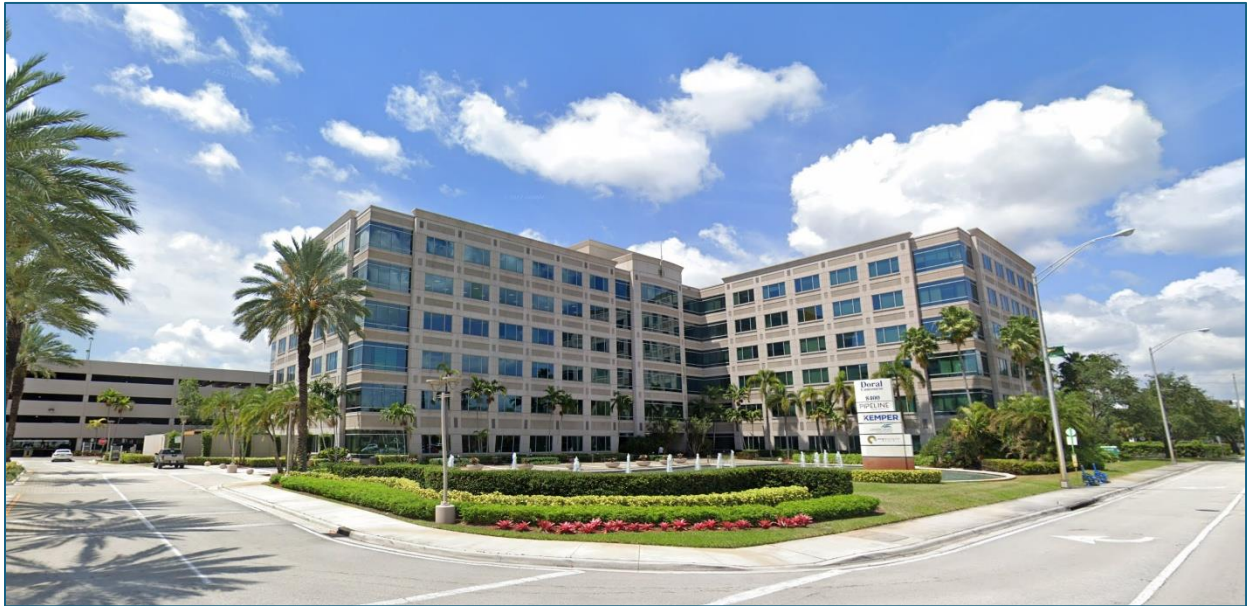
Image I. View of the Property from NW 36 Street & 84 Avenue

Existing site conditions are depicted on the following images: