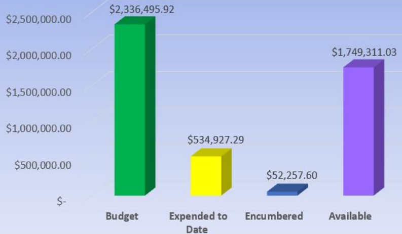
Trails Network Budget Status