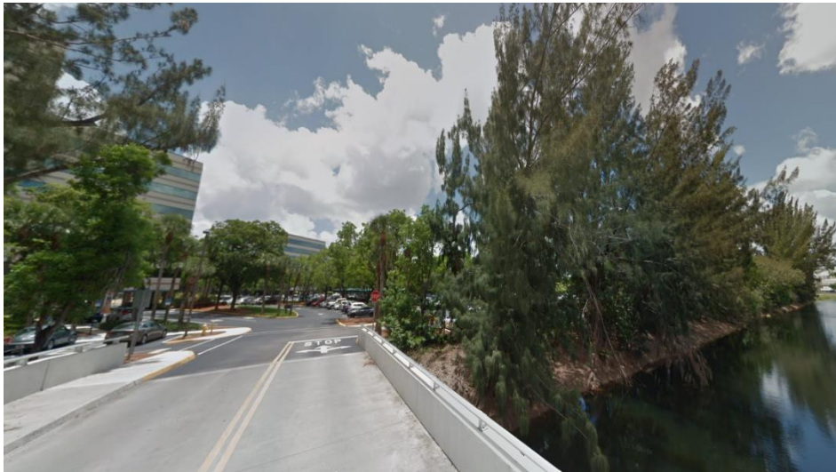
Image III. Interior view