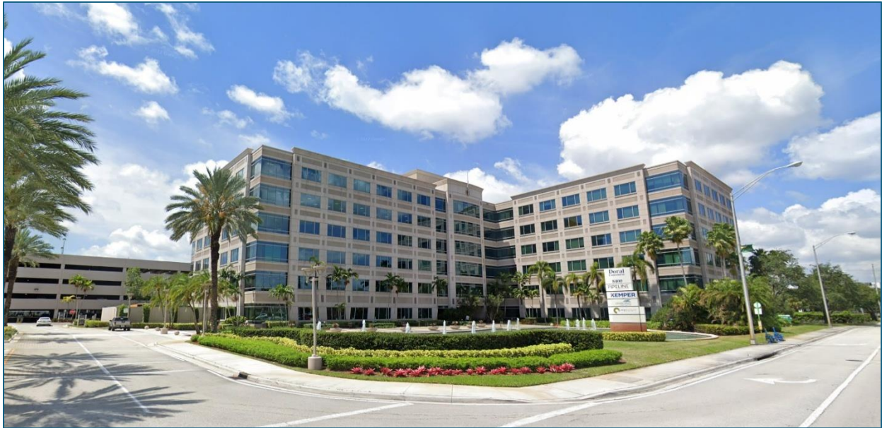
Image I. View of the Property from NW 36 Street & 84 Avenue

Existing site conditions are depicted on the following images: