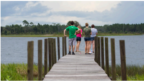
4-H Youth Development