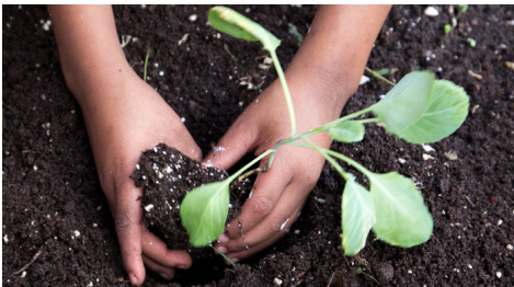
Lawn & Garden