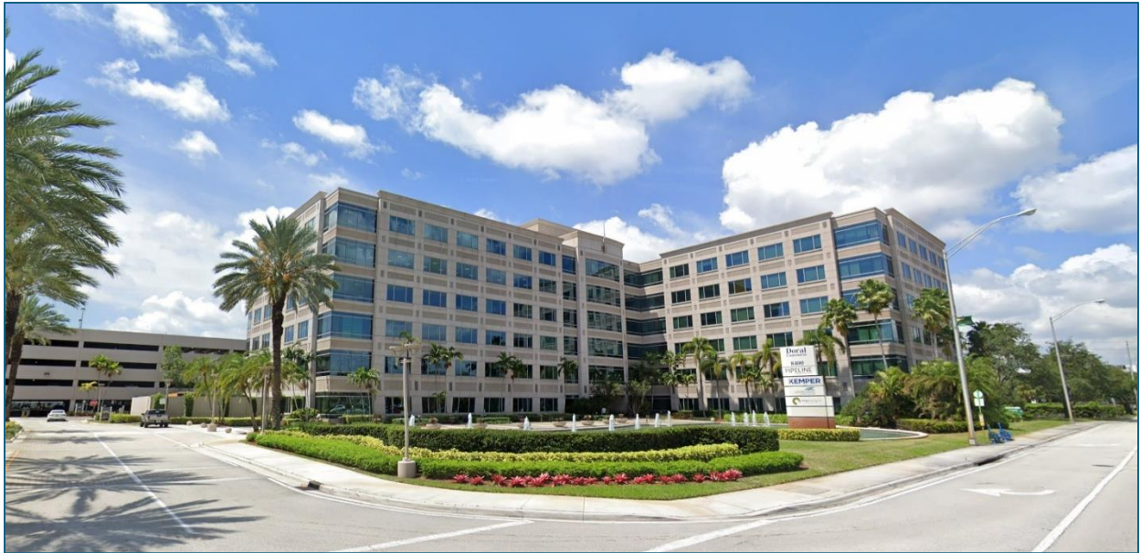
Image I. View of the Property from NW 36 Street & 84 Avenue

Existing site conditions are depicted on the following images: