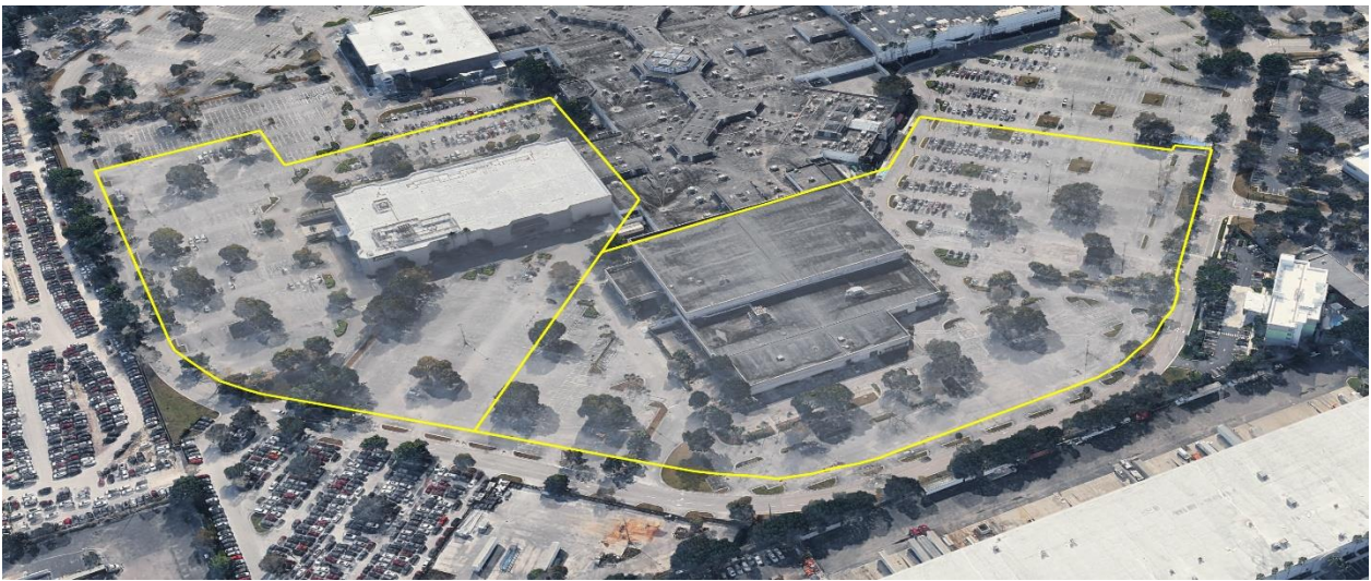
Image 3. Isometric aerial view of the property