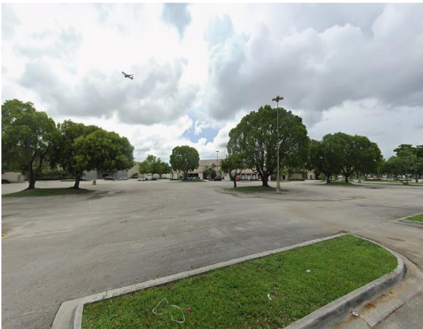
Image 3. Southeast corner of the property