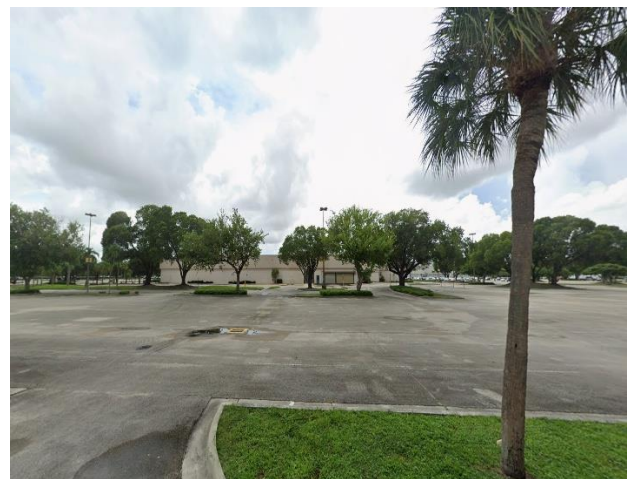
Image 4. Northside of the property