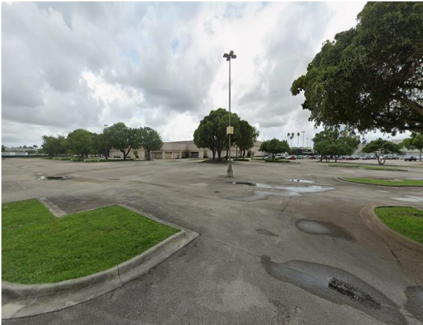
Image 1. Northwest corner of the property