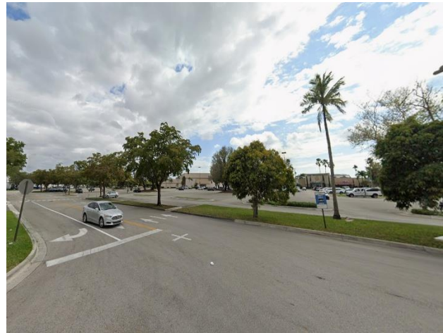
Image 2. Southwest corner of the property